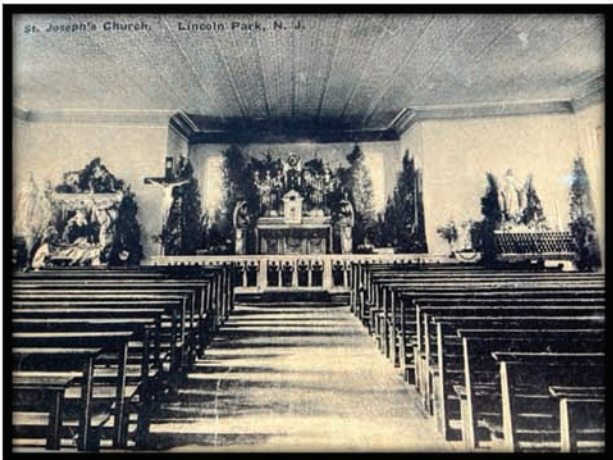
Interior of St. Joseph Church – 1930's