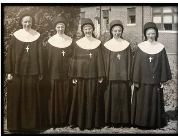
First Group of Sisters Teaching at St. Joseph - 1952