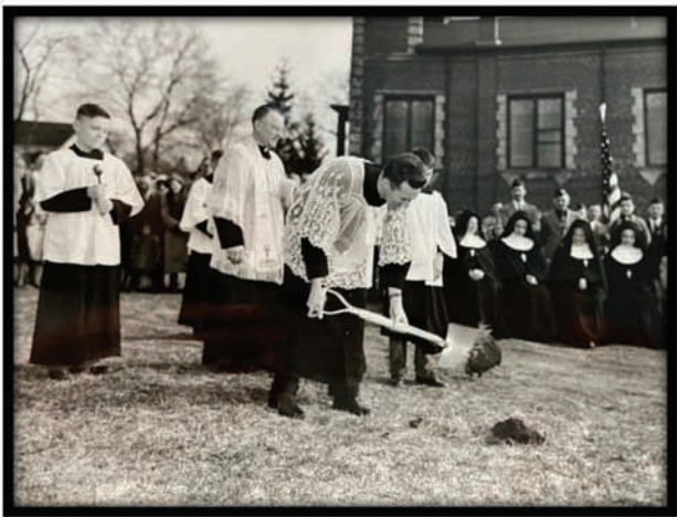
Ground Breaking for St. Joseph School – 1951