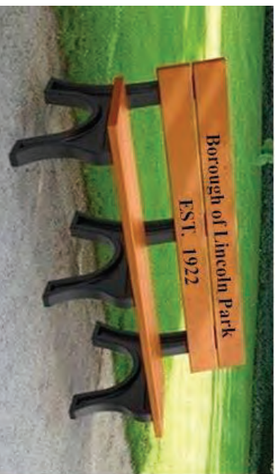
photo shown is for illustration purpose, actual product may